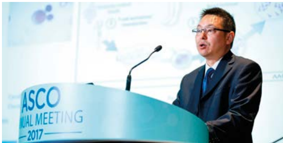
Caption: Dr Wanhong Zhao, MD, PhD presenting the results of the Chinese CAR T-cell clinical trial during the ASCO Annual Meeting

Early results from a clinical trial in China using a new type of immunotherapy to treat patients with relapsed or refractory myeloma has shown highly promising results. Thirty-three (94 per cent) out of 35 patients experienced lasting clinical remission after being treated with chimeric antigen receptor (CAR) T-cells targeting B-cell maturation protein (BCMA). The results were presented during the ASCO 2017 annual meeting.