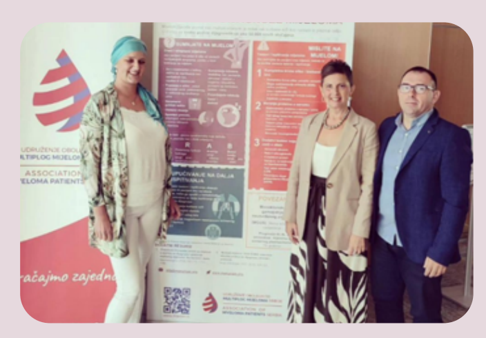
Association of Myeloma Patients Serbia