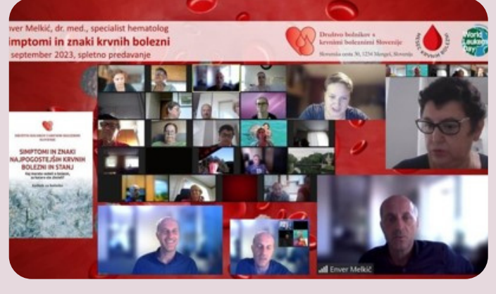
Društvo BKB Slovenija, Slovenia